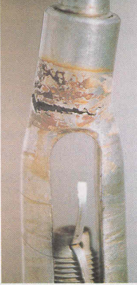
Round-head screws tapped and threaded into turnbuckle studs (above, left) don't require tape (which is bad for stainless steel) and are faster to remove in the event of a dismasting. Routine inspection revealed the dramatic fracture in the body of this turnbuckle (above, right). If we hadn't removed the tape for a closer look, the whole rig might have been lost.

is a solvent, not a lubricant. In fact, it removes lubricants. Super Lube grease or anhydrous lanolin is a good choice if you don't have molybdenum disulfide grease handy.